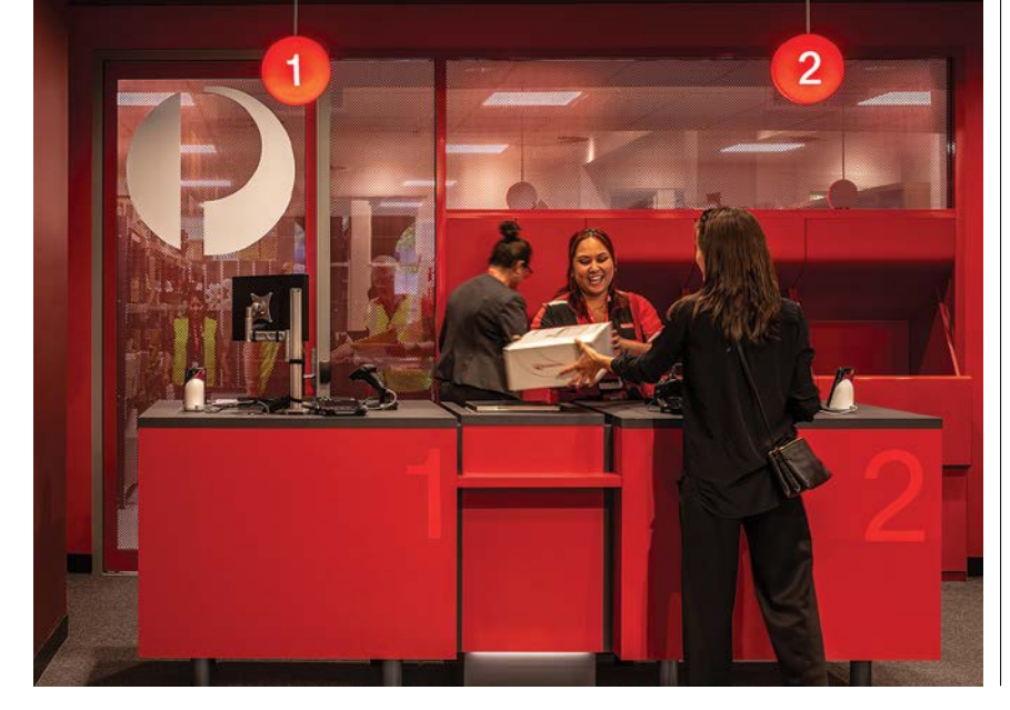
RIGHT With retail and banking available, the Orange Community Hub has transformedthe post office.

This isn't just a post office; it's a community cornerstone and represents a strategic move to make Australia Post more integral to daily life, one stamp at a time. - Georgia