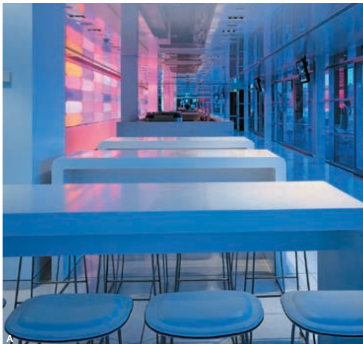
A Cruise bar interior B Identity reflected on bar C Graphic identity D Cruise bar exterior E Mirrored wall in restaurant