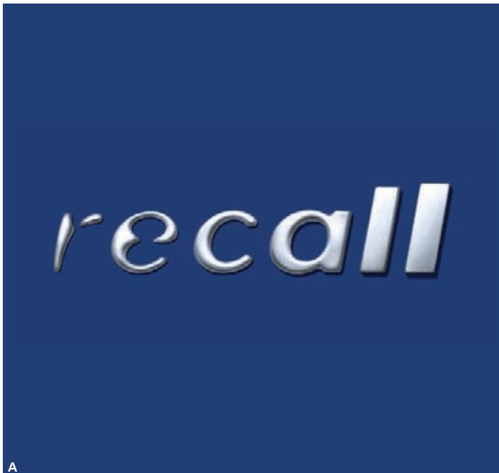
A The identity

What do you name a business that can store anything you like, anywhere in the world, and recover and relay specific information in a matter of minutes? We named it 'Recall'.